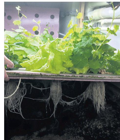
Floating raft technique showing roots below the raft; plants shown are (left to right) mint, leaf lettuce and nasturtium.