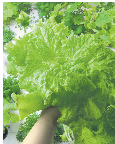
Leaf lettuce being held up; in the background nasturtium, chamomile, yarrow, mint and garden pinks grown with the floating raft technique.