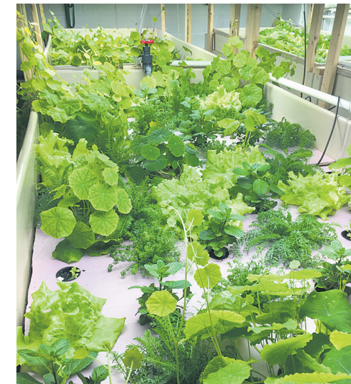
FIMTA floating raft grow-beds showing yarrow, mint, lettuce, chamomile and nasturtium after six weeks of growth at 13-15°C in effluent collected at a commercial salmon hatchery.